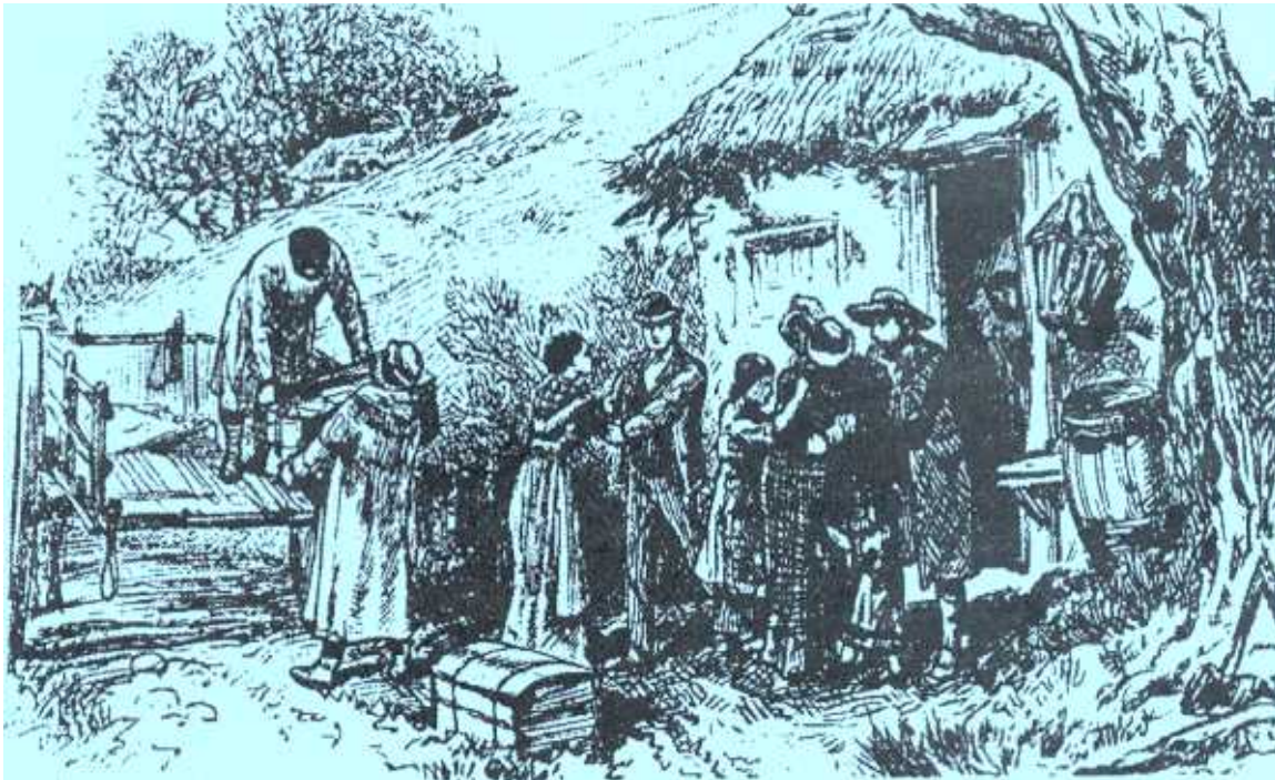
Emigrants leaving home in the west of Ireland. Sketch by Clarence O'Dowd NAC C-18682