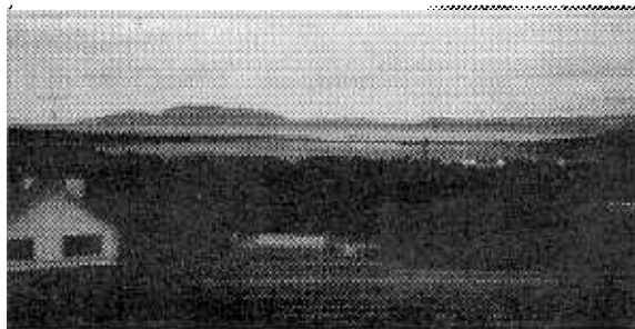
Farm near Grange village, Co. Sligo, overlooking Irishmurray Island.