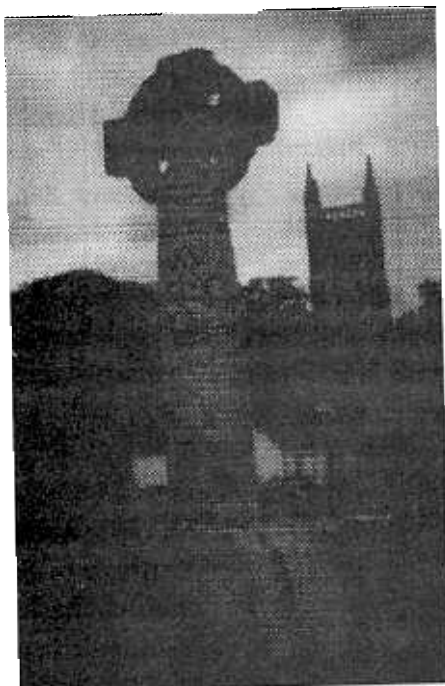
Intricately sculptured Celtic Cross at Drumcliffe, Co. Sligo.

Do not forget to let us know in your next what requisites will be necessary to bring with us and if farming implements are cheap and easy to get.